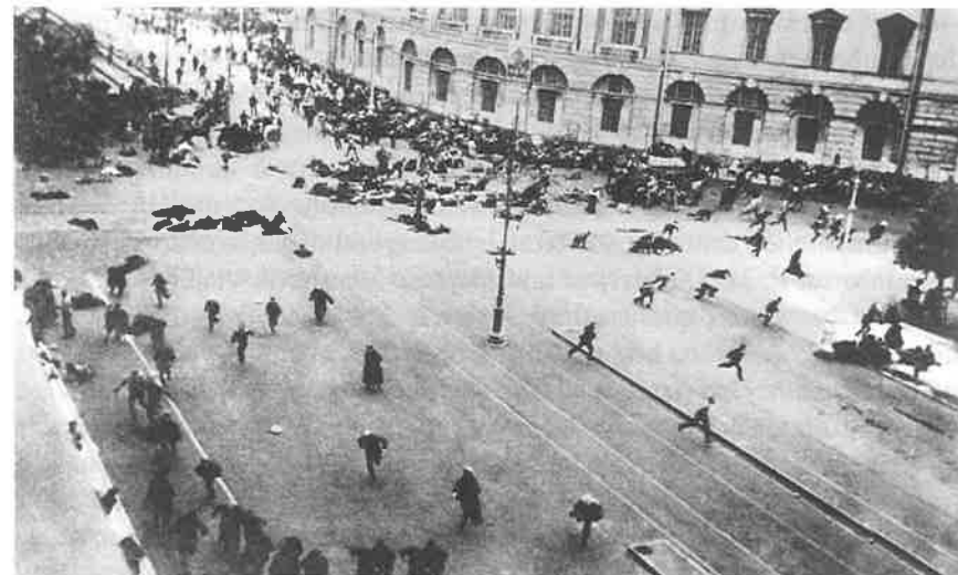
Figure 2.2 July Days protesters fired on by soldiers in Petrograd, 1917.

From May until October the Mensheviks and Socialist Revolutionaries sat in the government. As the government proved unable to solve the problems of the