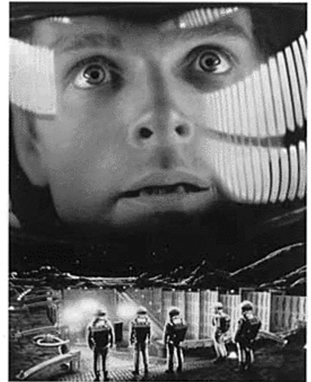
STANLEY KUBRICK'S 2001: a space odyssey