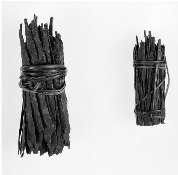
Figure 2. Bundles of iron rods/currency blades, Fang, Bene. Museum Purchase, Huntington Frothingham Wolcott Fund, 1920. Courtesy of the Peabody Museum of Archaeology and Ethnology, Harvard University, 20-29-50/B2167.

Iron and sugar mills have been understood as serving different technical functions. The crushing action of the sugar mill's grooved rollers separated the cane into two parts: the juice and the husk. By contrast the smooth rollers of the traditional European metal mill flattened and made uniform the iron sheet passed through them. 121 But in the Atlantic world of the African diaspora these European classificatory conventions were challenged, and sugar and iron shared much overlapping conceptual space. 122 Just as