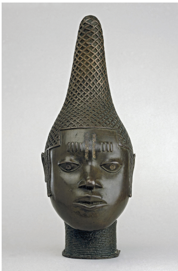
Figure 1. Thought to represent Queen Mother Idia, the eyes of this bust are inlaid with iron. Brass commemorative head, Edo, Benin City, early sixteenth century. British Museum No. Af1897,1011.1.

seventeenth century with a succession of major conflicts between different states corresponding with the Gold Coast, the Bight of Benin and the Bight of Biafra. Europeans and above all the British fuelled these wars, distributing weapons to all sides so they could profit from the turmoil. 20 As enslaved people overtook gold as the principal export, settlements became targets for raiding parties seeking captives to sell. Of the specialised ironworking societies of the Volta region, the Mawu, Lolobi and Santrokofi people who left for the hills between 1650 and 1750 were those who got away. 21