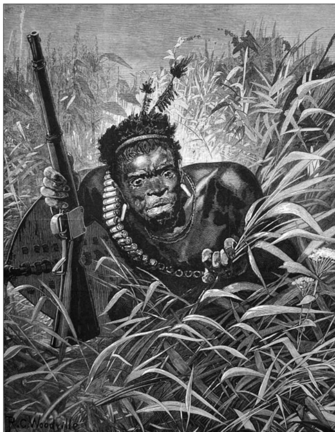
Fig. 2. 'A Zulu Scout': nineteenth-century depiction of the archetypal enemy, and environment, in 'savage warfare'. Illustrated London News , 26 July 1879.

counterinsurgency, with particular reference to the colonial experience of its armed forces. 6